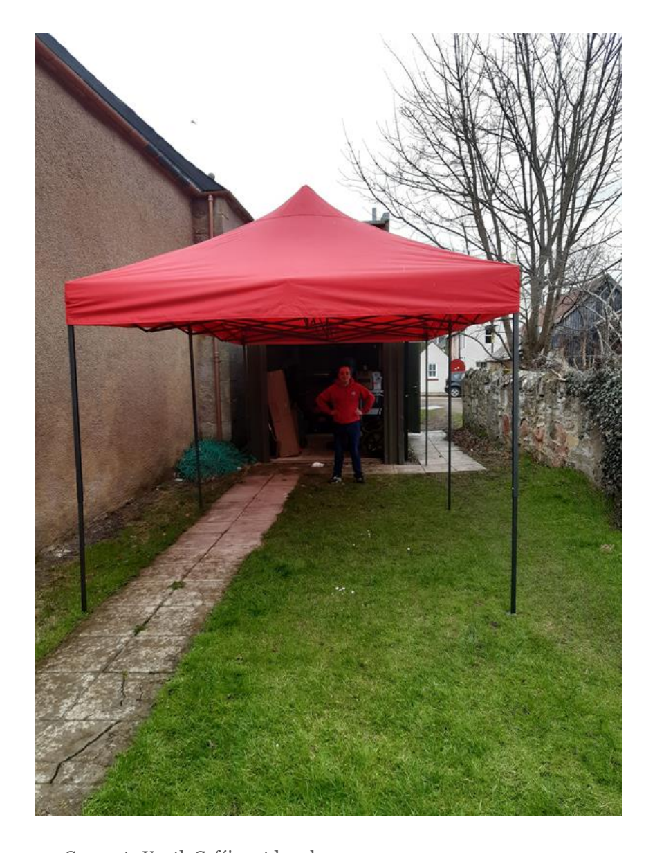
Cromarty Youth Café's outdoor home.