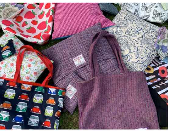
Last year's Sewing Weekend