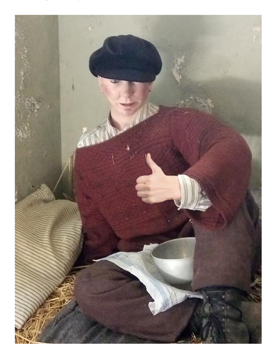
A figure in Cromarty Courthouse smiles and gives the big thumbs up: it's spring!

That's all we've got for now but stay tuned for next month's newsletter. Thanks for reading! Here's to brighter and lighter days.