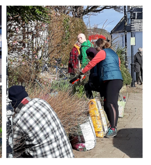
Volunteers giving the community beds a spring clean in the sunshine.