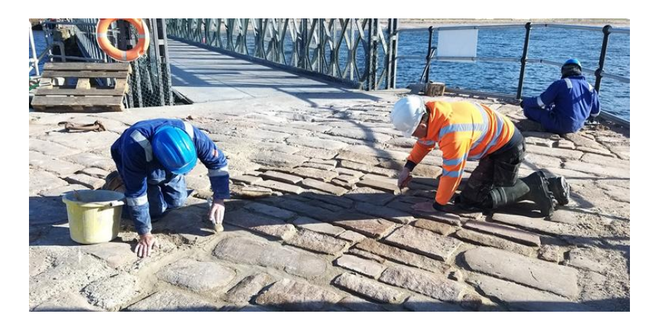
Mole repairs at the harbour

Finally, I should clarify there is no truth in the rumour that we will be renaming Cromarty Harbour "Cromarty Marina"... It must just be the time of the year!