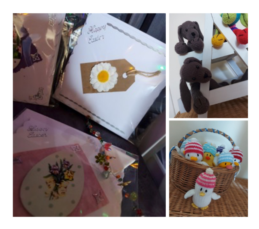
Some of the gifts and cards located at the Jalidor in Bayview Crescent